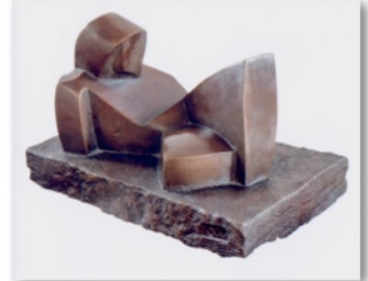
Plants to create the perfect backdrop to the bronze 'Eva'

Phyliostachys Nigra 'Black Bamboo' Asarum Europaeum 'Wild Ginger' Matteuccia struthiopteris 'Shuttlecock Fern' Dryopteris filix-mas 'Male Fern' Polypodium vulgare 'Common Polypody' Panicum virgatum 'Heavy Metal' Switch Grass