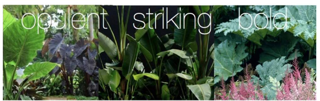
Plants to create the perfect backdrop to the bronze 'Mellifluous'

Plants to create the perfect backdrop for a stone sculpture